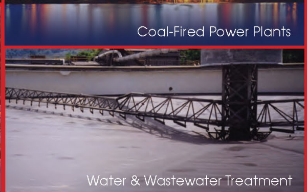
Water & Wastewater Treatment