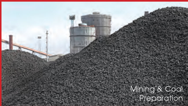
Mining & Coal Preparation

4X better abrasion resistance than competition*