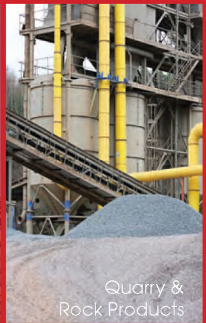
Quarry & Rock Products